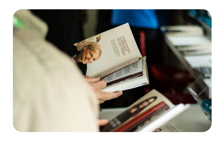
If the value of your pension is nearing the Lifetime Allowance

However, you can usually access small pots without triggering the MPAA.